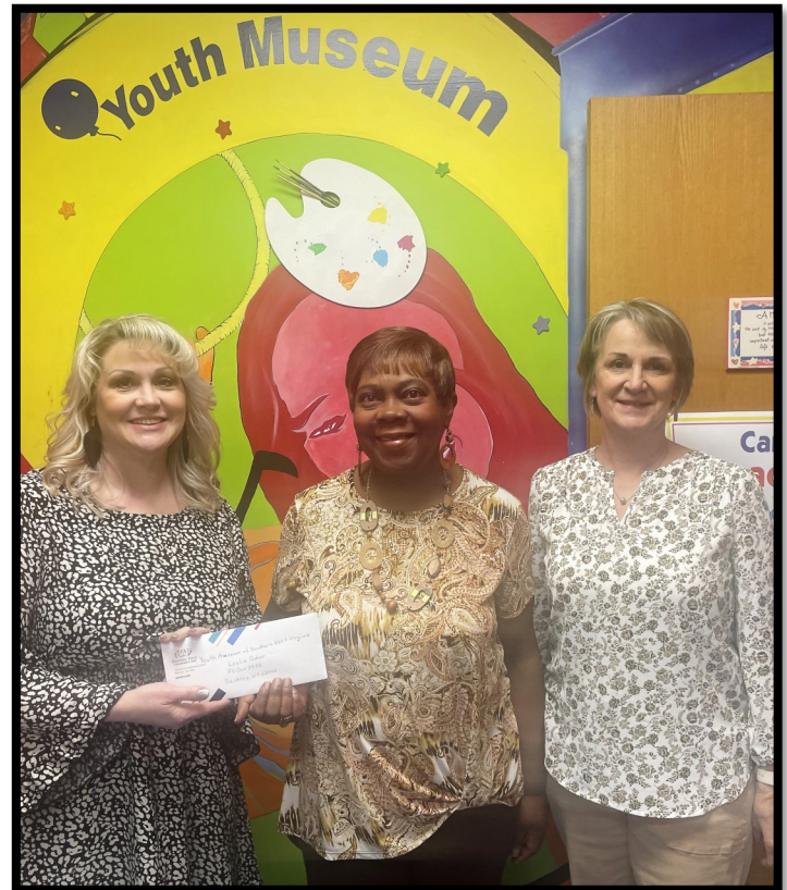
Youth Museum Designated Distribution check delivery | 2023

The Youth Museum is open year-round and offers changing interactive exhibits on art, history, science & nature. The current exhibit is Animation Land, where you can learn how to create animation at a variety of different stations set up throughout the building.