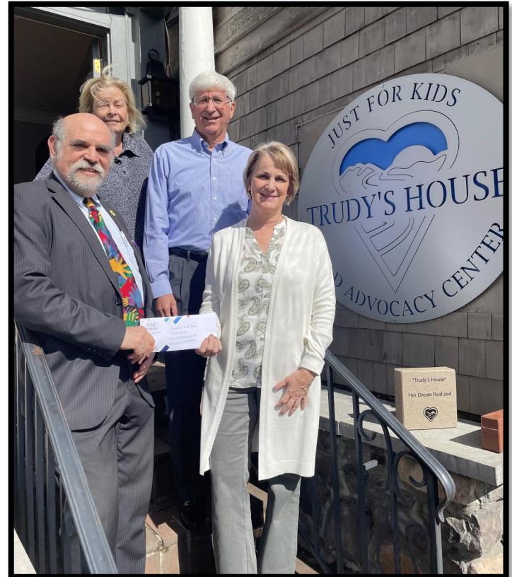
Just For Kids Designated Distribution check delivery | 2023

Just for Kids (JFK), Inc. is dedicated to helping children heal from abuse in Raleigh & Fayette counties. Since opening their doors in 2003, JFK has served more than 3,500 children.