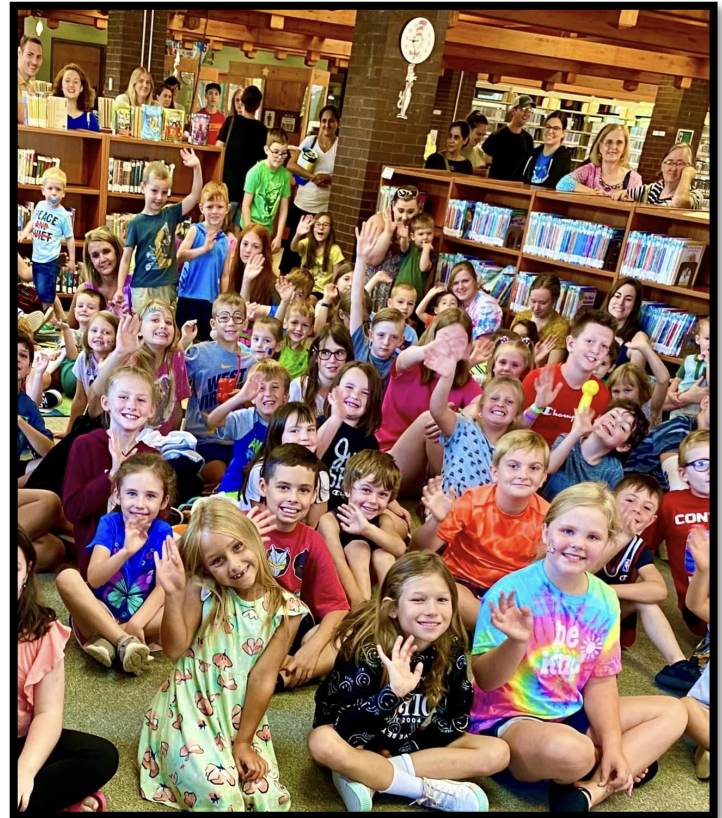
Raleigh County Library Summer Reading Program | 2022

The Raleigh County Public Library's project in 2022 was a summer reading program to help maintain the children's reading levels between school sessions. Children 3-13 kept a reading log each week to show that they completed their book. The majority of children in the program read at least 8 books over the summer. Prizes and crafts were also incorporated into the program to help incentivize reading.