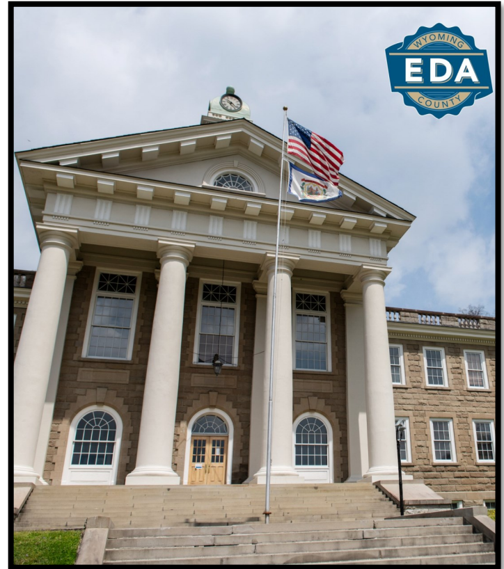
Wyoming County Courthouse | 2022

The Community Fund, in partnership with the Wyoming County Planning Commission and Wyoming County EDA, has been a tremendous asset to Wyoming County. In addition to the scholarships awarded from the fund, the Community Fund has provided six community grants for projects such as after school programs, Energy Express, picnic tables for parks, feeding the hungry through "Empty Bowls", and gateway signage.